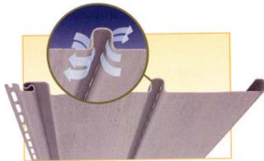
THE HIDDEN RIDGE™ VENTILATION SYSTEM FEATURES VENTING SLOTS HIDDEN IN THE U-GROOVES OF THE SOFFIT PANELS. THIS PROVIDES EFFICIENT FLOW OF AIR FOR PROPER VENTILATION, WITHOUT THE UNATTRACTIVE HOLES OR LANCED AREAS VISIBLE IN STANDARD SOFFIT PANELS.

.3/4" Butt -Creates a tighter, more secure lock between panels. A Wide Assortment of Colors-For beautifully matching or contrasting your home's siding to create a distinctive look. Lifetime Fade Protection-Featuring ColorHold_ a UV-stable acrylic polymer that has excellent fade-resistant properties.