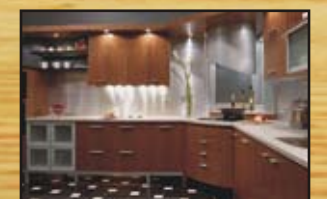
Kitchen Views Showrooms

Everything in Building Materials PLUS the SERVICES you deserve! 1-800-370-WOOD